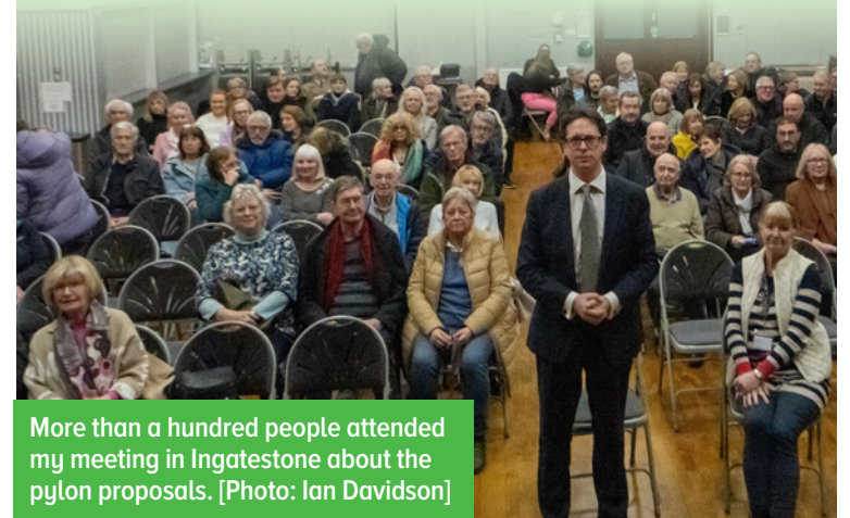
More than a hundred people attended my meeting in Ingatestone about the pylon proposals.

I'm delighted to be able to say that following a campaign by myself and my colleagues an independent review is going to be undertaken by the Electricity System Operator to consider alternative offshore routes for electricity transmission in East Anglia. I am very pleased that, at last, people living on the route will see a comprehensive cost benefit analysis of offshore versus onshore options. Whilst this is no guarantee that plans for onshore pylons will be cancelled, it is an important step – I am urging ESO to involve my constituents in the process as much as possible. ■