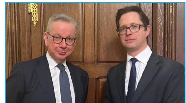
Meeting the Secretary of State for Levelling up, Housing and Communities, the Rt. Hon. Michael Gove MP, to discuss the huge cost to local councils in tackling unauthorised development in the green belt

Brentwood Borough Council have been fighting a lengthy court battle to see that justice is done – but the process has shown me that the current law makes it far too difficult and expensive for local authorities to intervene. This is why I've taken the concerns of residents in Warley and Navestock to the attention of the Secretary of State and Ministers in the Department for Levelling Up, Housing and Communities, Michael Gove. I am reassured the Levelling Up and Regeneration Bill will strengthen planning enforcement and that fines for certain planning breaches will be increased. But I shall be monitoring things closely to see if further changes to the law are needed. ■