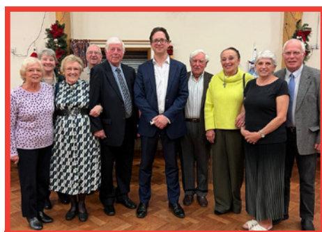
The wonderful Abridge Supper Club