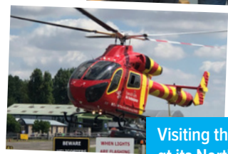
Visiting the Essex and Herts Air Ambulance at its North Weald Airfield Base