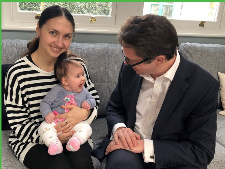
Meeting one of the youngest Ukrainian refugees, born in the UK after her mother and brother fled the bombing in Ukraine

Local charities rallied to help those left in Ukraine