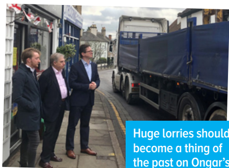
Huge lorries should become a thing of the past on Ongar's historic High Street

The way we work has changed since Covid and I've been very impressed how local businesses (like the Spread Eagle in Brentwood, pictured), are making the most of new trade from those now working from home and able to socialise locally again. Here's to a better year for business, post pandemic. ■