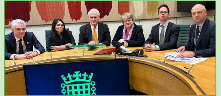
Joining fellow Essex, Suffolk and Norfolk MPs to meet Energy Security and Net Zero Minister, the Rt. Hon. Graham Stuart MP

Almost a hundred Ingatestone residents attended a meeting I organised recently to discuss National Grid's plans to build a chain of colossal pylons from Norfolk to Tilbury, cutting through countryside around Ingatestone, Hutton and Dunton.