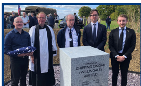
Unveiling the Airfields of Britain Conservation Trust Memorial at the site of Chipping Ongar (Willingale) Airfield