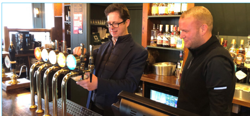
Pulling a pint in the newly refurbished Spread Eagle Pub in Brentwood