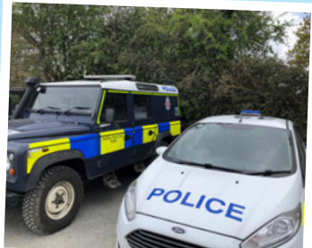
Tackling rural crime in the villages around Brentwood and Ongar