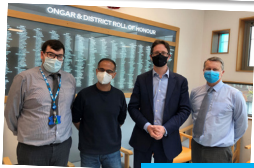
Meeting Ongar Health Centre's team to hear about improvements to booking appointments