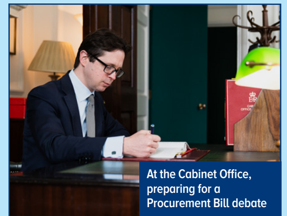
At the Cabinet Office, preparing for a Procurement Bill debate

One of my major tasks has been to take the Government's Procurement Bill through the Commons. Now we are outside the EU it is possible for us to improve the previously cumbersome procurement rules to ensure that the £300bn we spend on procurement is spent better for taxpayers, public authorities, and British business. Crucially, as part of this work, we're making it easier for small and medium sized businesses to bid for public sector contracts – creating new opportunities for local suppliers to get work without being squeezed out by large firms. ■